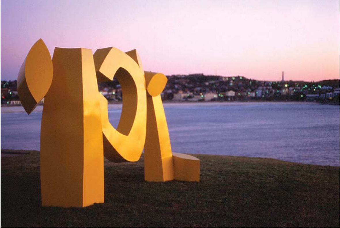
P. Spelman 'Ylang-Ylang'