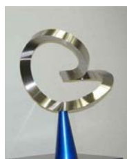
M. Takeuchi 'Transfiguration XIV'