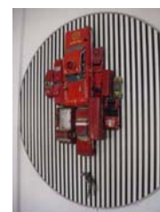
T. Carbonel 'Road Rage'

For more information, images or to arrange interviews please contact: For more information, images or to arrange interviews please contact: