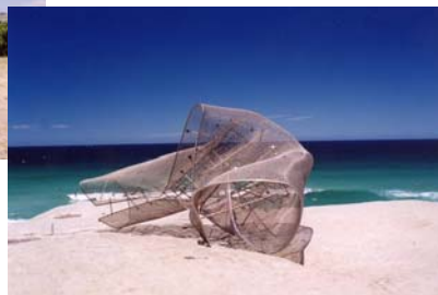
Korban/Flaubert 'Siren'

For more information, images or to arrange interviews please contact: For more information, images or to arrange interviews please contact: