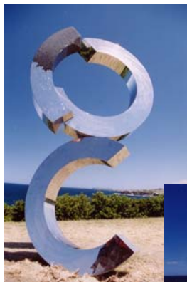
K.Oishino (Japan) 'Wind Stone - Annular Flow' Photo C.Yee 2003